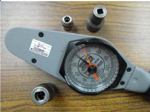
Suggested tools to service packed line valves