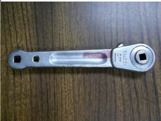
Standard Refrigeration wrench

Suggested packing gland and stem torque values for specific valves are listed in the Technical Information section for each product line.